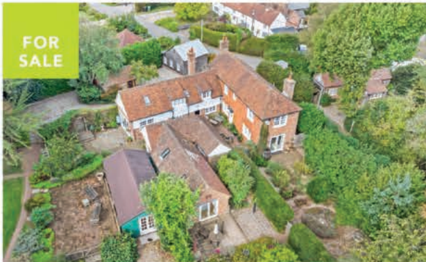
Mill Corner, Northiam Guide Price £1,395,000