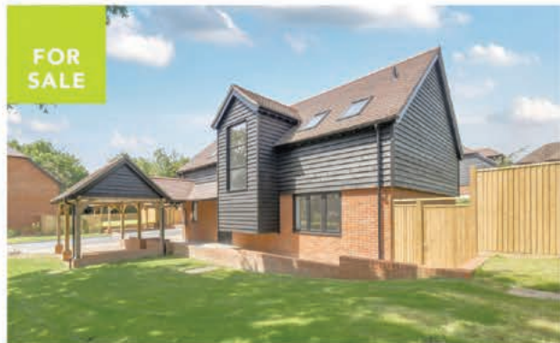
Standen Street, Iden Green Guide Price £825,000