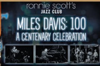
Ronnie Scott's Jazz Club Miles Davis 100 A Centenary Celebration 27 March