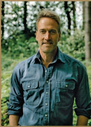
Ben Fogle 23 February