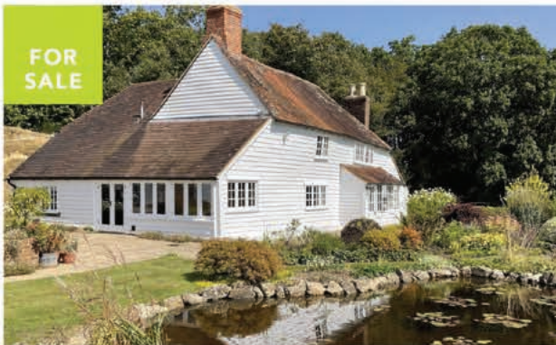
Water Lane, Hawkhurst Guide Price £995,000