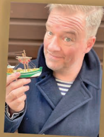
Attention All Shipping 26 February