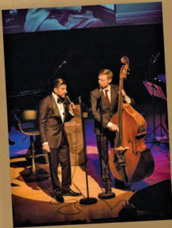
The Nat King Cole Story 13 February