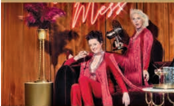
Scummy Mummies: Hot Mess 13 March