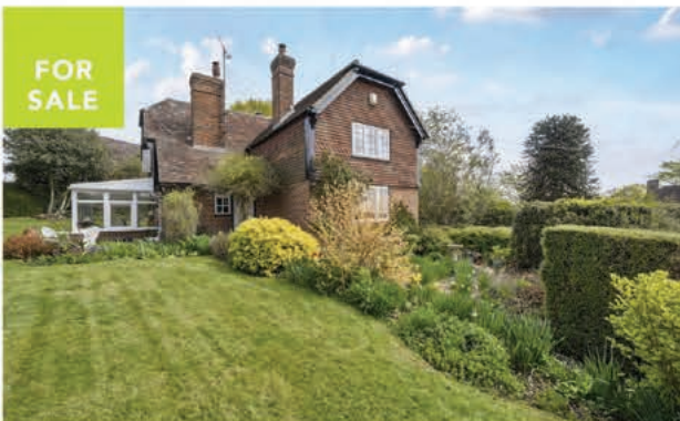
Mill Street, Iden Green, Guide Price £770,000