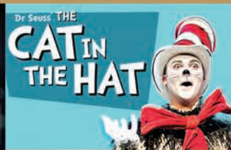
The Cat in the Hat 16 April