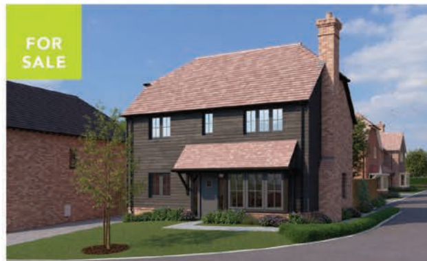
Benenden Meadows, Benenden Guide Price £675,000

Call 01580 712 888 , visit www.lambertandfoster.co.uk or email cranbrook@lambertandfoster.co.uk