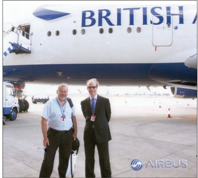
First A380 delivery to British Airways

All this is a long way off those dreams and thoughts of a small boy gazing into the skies above a little village on the borders of Kent and East Sussex! To Dream is to Believe.