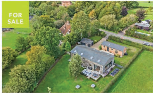
Pluckley Road, Smarden Guide Price £1,300,000