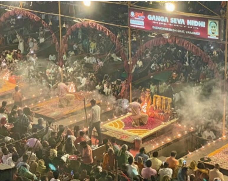
The evening prayer ceremony “Ganga Aarti”.

This was not our first trip to India. Having visited six years ago on a classic “Golden Triangle” tour which we loved so much, we vowed to come back to see more. The India we saw then was very different from the India we saw this time. India is projected to be the fastest-growing major economy in 2026 with a projected growth rate around 6.2%, driven by strong domestic demand, technological advancements and infrastructure investment, all of which were apparent on our travels, even in more remote areas.