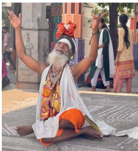
Joyful Brahmin at Kapaleeswarer Temple in Chennai